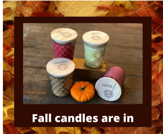
Fall candles are in